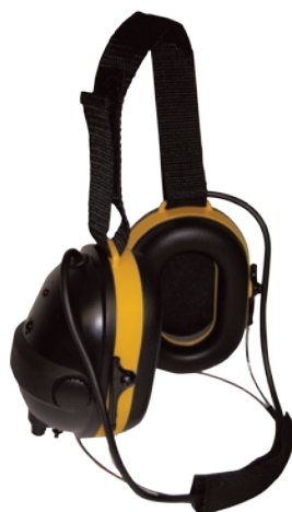
Model PA4100 - Behind-The-Head