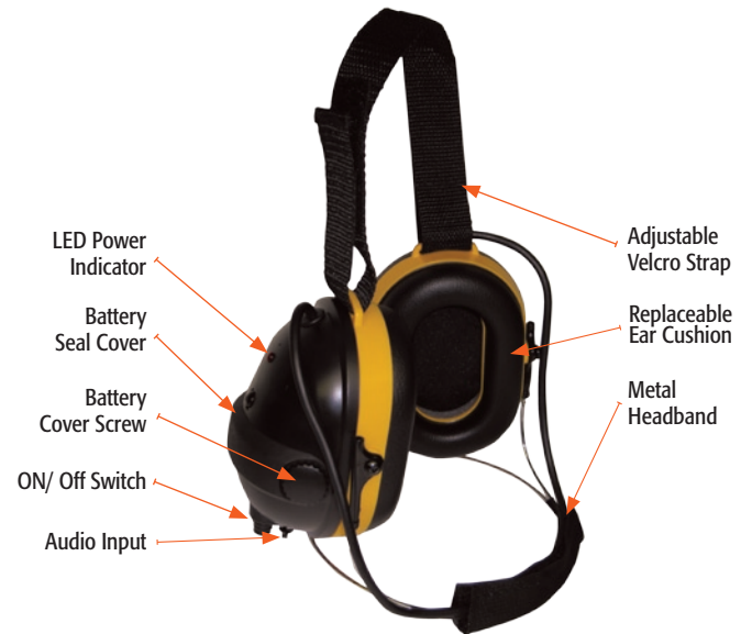
Model PA4100 - Behind-The-Head