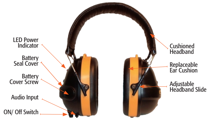
Model PA4000 - Over-The-Head

Master carton cube: 1.88 cubic feet Master carton weight: 14.5 lb.