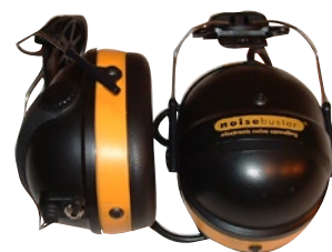
Model PA4200 - Hard Hat Cap Mount