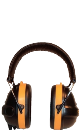
Model PA4000 - Over-The-Head

ANR is the most effective defense against low-frequency noise. Low-frequency noise consists of powerful sound waves that can travel great distances and cannot be absorbed by conventional passive materials. Noises generated by engines, blowers, motors, fans, vacuums, pumps, generators and other similar devices are typically dominated by low frequencies—frequencies that cannot be stopped by passive earmuffs. In addition to the detrimental effect it has on hearing, low-frequency noise creates another, perhaps even more serious effect. Because low-frequency noise masks speech, it is difficult for a person to hear and comprehend speech and warning signals when exposed to such noise.