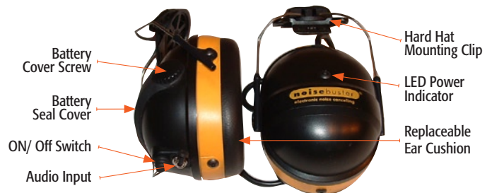
Model PA4200 - Hard Hat Cap Mount